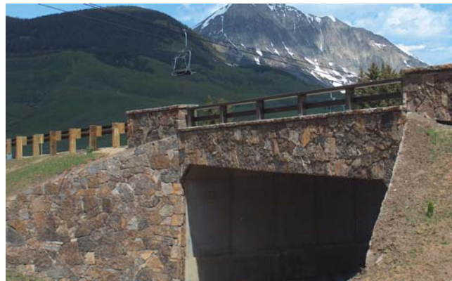
Prospect at Mount Crested Butte, Phase I, in Mount Crested Butte Schmueser Gordon Meyer Inc.