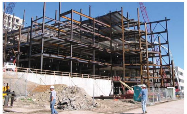
Mercy Medical Center Additions in Des Moines – Structural Consultants Inc.