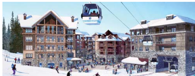
The Village at Northstar, Phases III and IV, in Truckee, Calif. Beaudin Ganze Consulting Engineers Inc.