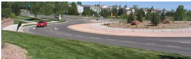
The 88th Avenue and Rock Creek Parkway roundabout in Superior LSC Transportation Consultants